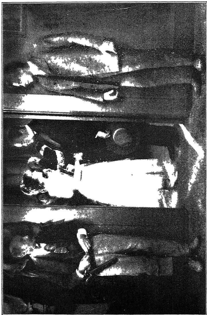
A Metro Goldwyn Mayer Picture LIGE AND SOURDOUGH WAIT TO SEE LETTY, SO THAT THEY CAN "POP THE QUESTION" The Wind,